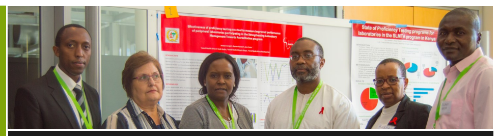
SLIPTA/SLMTA Symposium at ASLM2016, Cape Town