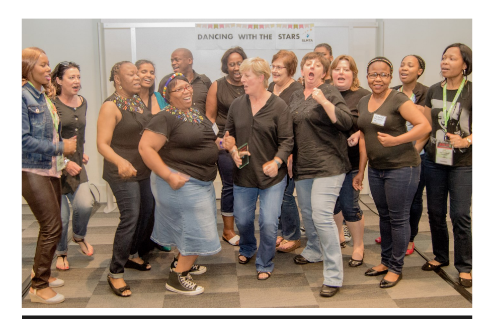
"Shosholoza " - South Africa showcasing their SLMTA Spirit with an invigorating song and dance \,